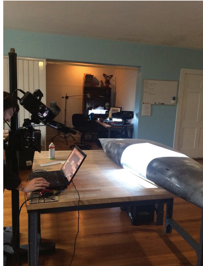
⤴ Capturing 3D scans of the kayak in several sections using a 3D scanner.

Photogrammetry markers were placed on the kayak to automated the alignment of 3D scan data. It significantly reduced the amount of time it took to merge and align the individual scans into a complete digital model. Otherwise it would be done manually which would be a time consuming process.