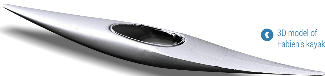
⤵ 3D model of Fabien's kayak.